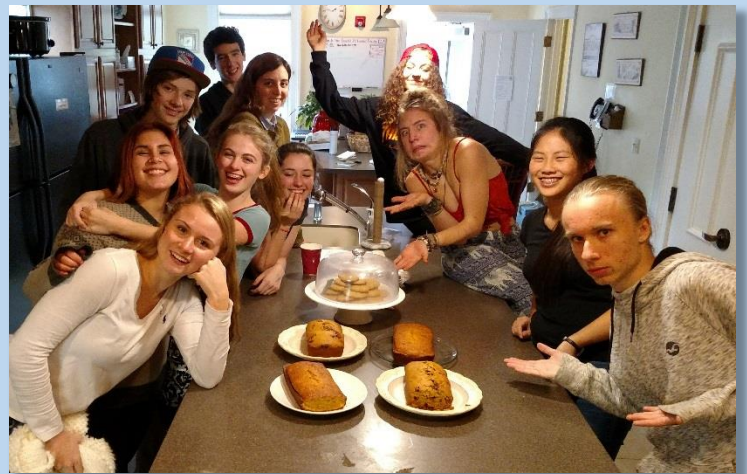
Big Picture students display their baking skills at RMHC.

On November 11 th , Big Picture 101 spent the day baking bread and cookies for the Ronald McDonald House, a residence for families with seriously ill children seeking treatment at the UVM Children's Hospital. The 101 students selected recipes, bought ingredients, and baked in teams in the Ronald McDonald House kitchen. Volunteering in the community is an embedded component of the Big Picture curriculum, and the 101 students are planning on returning to Ronald McDonald House to bake again in the spring. Other volunteering this fall has included helping erect fencing at New Village Farm and painting walls at The Generator, a Burlington makers' space.