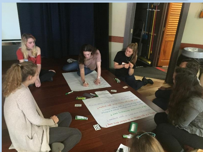
Above- Students and educators discuss Project-Based Learning at Big Picture's student gathering.